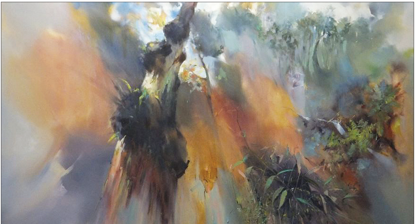
SATURDAY 6 APRIL - ROBERT KNIGHT DEMONSTRATION - LANDSCAPE IN OIL