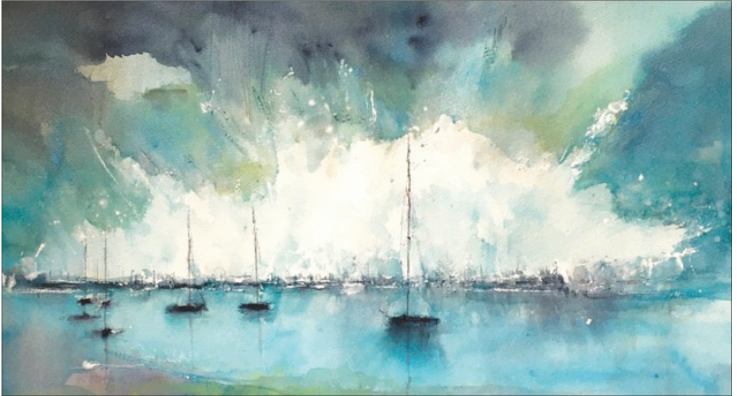
SATURDAY 2 MARCH - PETER PORTEOUS - AROUND THE BAY IN WATERCOLOUR