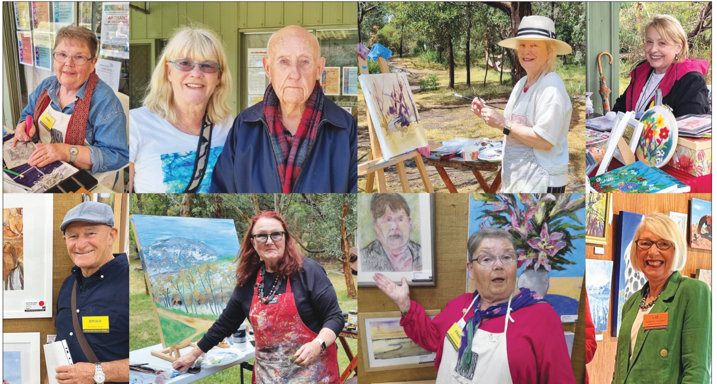
ARTISANS AT McCLELLAND 2023 - ART EXHIBITION